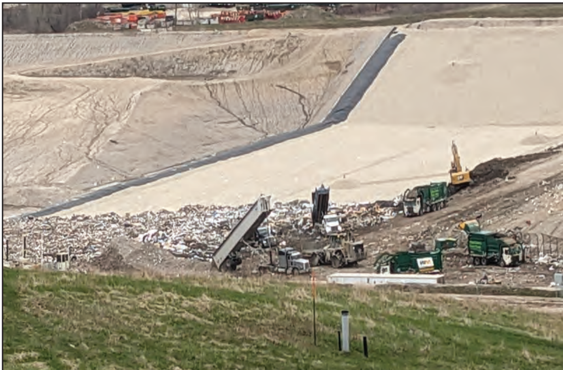
Fluff layer reaching ~50% of coverage