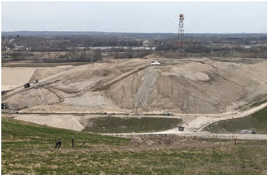
Crested cells, Phases 1 & 2 of North Expansion West