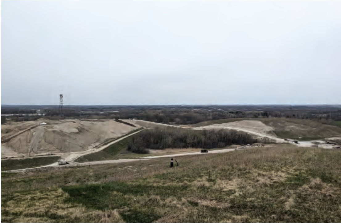
Access road now travels to soil stockpile and around preserved trees to working face