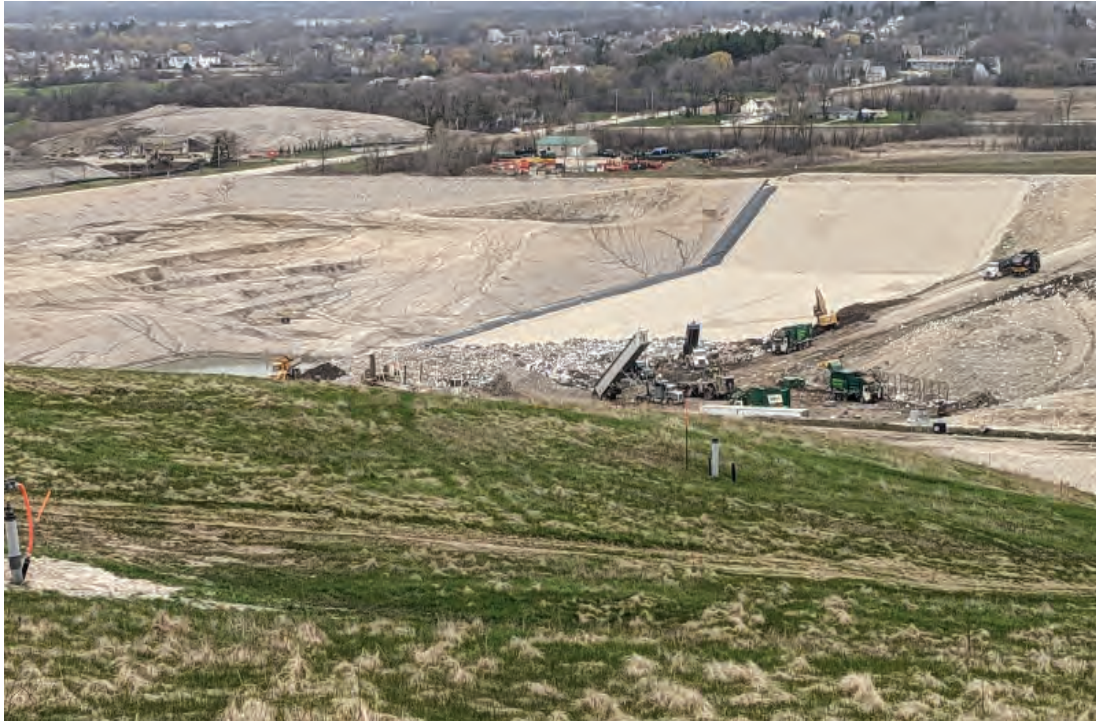
Fluff layer placement started at South end of New Cell and progressing Northward