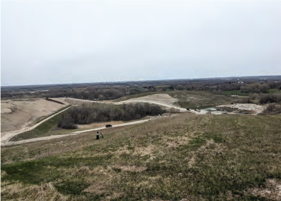
Vehicles no longer allowed on South and West slopes of North Expansion West